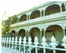
1 eastcourt h87 may 2001