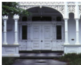
Eastcourt Powlett Street East Melbourne Detail Entrance