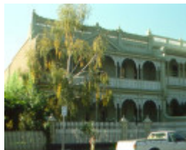
Eastcourt Street Facade May 2001