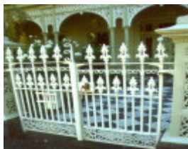
Eastcourt Front Gate May 2001