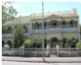
EASTCOURT SOHE 2008