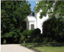
CRANLANA SOHE 2008