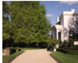
1 cranlana clendon road toorak drive & entrance