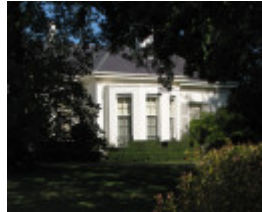
CRANLANA SOHE 2008