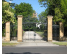
CRANLANA SOHE 2008