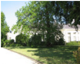
CRANLANA SOHE 2008