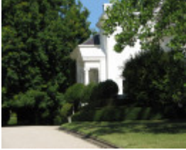
CRANLANA SOHE 2008