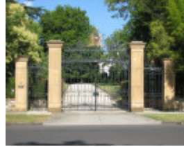
CRANLANA SOHE 2008