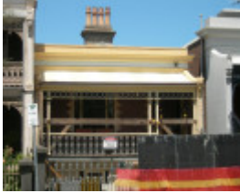
BUILDING SOHE 2008