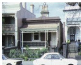
1 residence 130 powlett street east melbourne front elevation