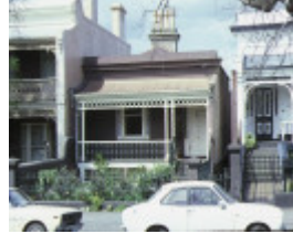
1 residence 130 powlett street east melbourne front elevation