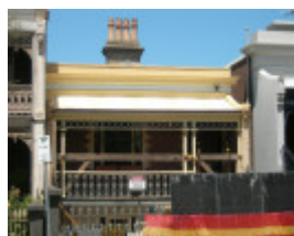
BUILDING SOHE 2008