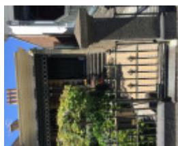
RESIDENCE October 2016