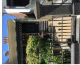
RESIDENCE October 2016