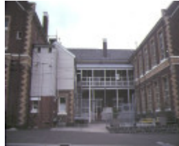
former yarra park primary school no1406 punt road east melbourne rear view may 1985