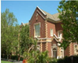
FORMER YARRA PARK PRIMARY SCHOOL NO. 1406 SOHE 2008