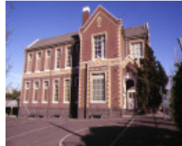
1 former yarra park primary school no1406 punt road east melbourne front view