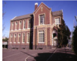
1 former yarra park primary school no1406 punt road east melbourne front view