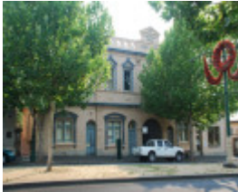
BENDIGO TEMPERANCE HALL SOHE 2008