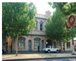
BENDIGO TEMPERANCE HALL SOHE 2008