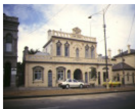
1 bendigo temperance hall bendigo front view apr1997