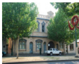
BENDIGO TEMPERANCE HALL SOHE 2008