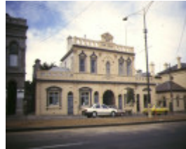
1 bendigo temperance hall bendigo front view apr1997