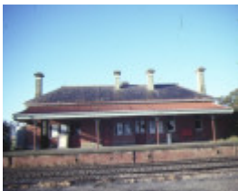
avoca railway station york avenue avoca front view aug1984