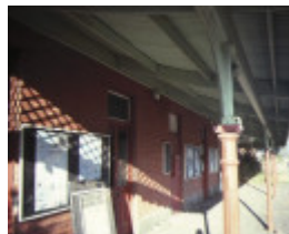
avoca railway station york avenue avoca platform view aug1984