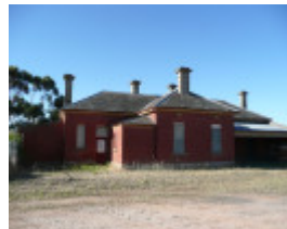
AVOCA RAILWAY STATION SOHE 2008