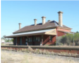
AVOCA RAILWAY STATION SOHE 2008