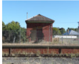
AVOCA RAILWAY STATION SOHE 2008