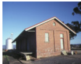
avoca railway station york avenue avoca goods shed aug1984