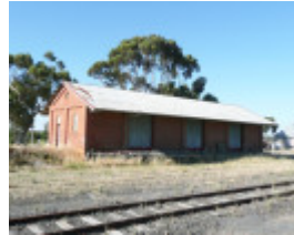
AVOCA RAILWAY STATION SOHE 2008