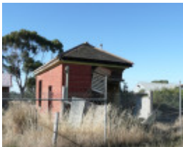
AVOCA RAILWAY STATION SOHE 2008