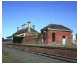
1 avoca railway station york avenue avoca trackside view nov1993