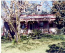
h01297 the grange belgrave street coburg front view she project 2003