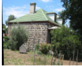
THE GRANGE SOHE 2008