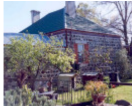
h01297 the grange belgrave street coburg side view she project 2003