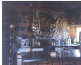
h01297 the grange belgrave street coburg kitchen she project 2003