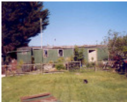
h01297 the grange belgrave street coburg stables she project 2003