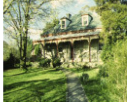
1 the grange belgrave street coburg front view sep1996