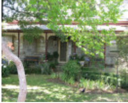
THE GRANGE SOHE 2008