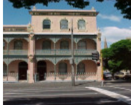
1 terrace 146 victoria parade east melbourne front view oct1999