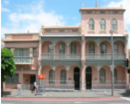
TERRACE SOHE 2008