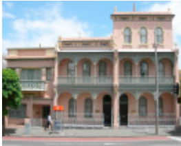
TERRACE SOHE 2008