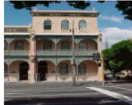
1 terrace 146 victoria parade east melbourne front view oct1999