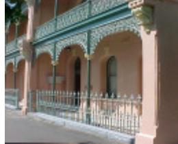
terrace 146 victoria parade east melbourne front elevation oct1999