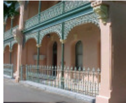
terrace 146 victoria parade east melbourne front elevation oct1999