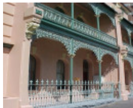
terrace 148 victoria parade east melbourne front elevation oct1999