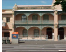
1 terrace 148 victoria parade east melbourne front view oct1999