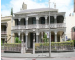
TERRACE SOHE 2008