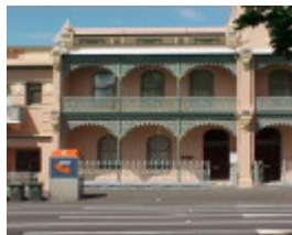
1 terrace 148 victoria parade east melbourne front view oct1999