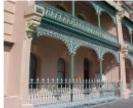
terrace 148 victoria parade east melbourne front elevation oct1999