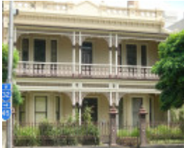
ARDEE SOHE 2008