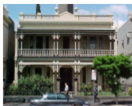
ardee 166 victoria parade east melbourne front view oct1999