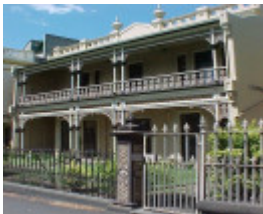
ardee 166 victoria parade east melbourne front elevation oct1999