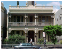
ardee 166 victoria parade east melbourne front view oct1999