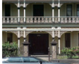
ardee 166 victoria parade east melbourne entrance detail oct1999