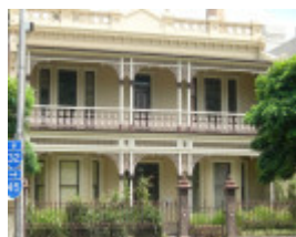
ARDEE SOHE 2008