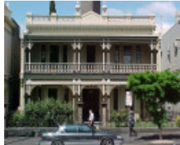
ardee 166 victoria parade east melbourne front view oct1999