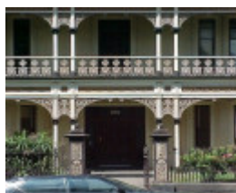
ardee 166 victoria parade east melbourne entrance detail oct1999