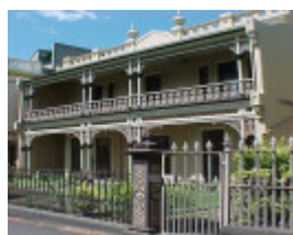
ardee 166 victoria parade east melbourne front elevation oct1999