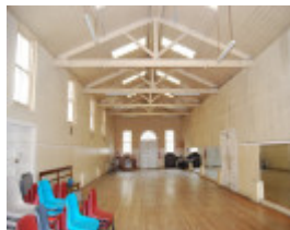
H2172 All Saints Hall King William Street Fitzroy April 2008 5