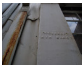
H2172 All Saints Hall King William Street Fitzroy April 2008 13