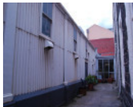
H2172 All Saints Hall King William Street Fitzroy April 2008 10