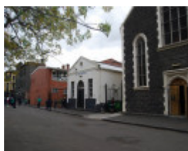
H2172 All Saints Hall King William Street Fitzroy April 2008 14