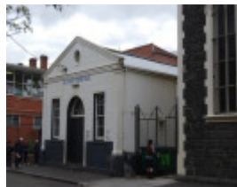
H2172 All Saints Hall King William Street Fitzroy April 2008 compressed