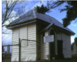
1 maldon road toll house muckleford front view