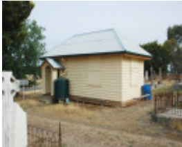
MALDON ROAD TOLL BAR HOUSE SOHE 2008