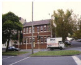
former christian brothers college external back