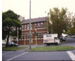
former christian brothers college external back