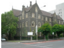
CATHEDRAL COLLEGE SOHE 2008