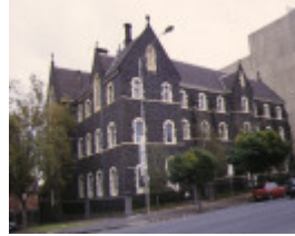
1 former christian brothers college external front