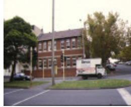
former christian brothers college external back