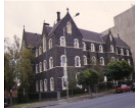
1 former christian brothers college external front