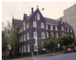
1 former christian brothers college external front