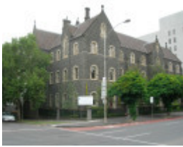
CATHEDRAL COLLEGE SOHE 2008