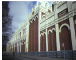
former victoria brewery victoria parade east melbourne front view sep 1985