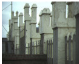
former victoria brewery victoria parade east melb detail of castellated style roof sep1985