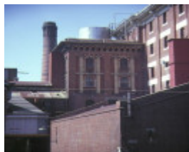
former victoria brewery victoria parade east melbourne rear view mar1985