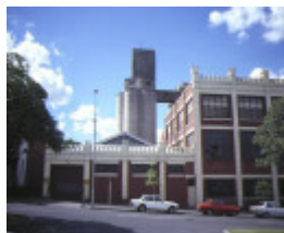
former victoria brewery victoria parade east melbourne side view oct1985