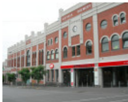
FORMER VICTORIA BREWERY SOHE 2008