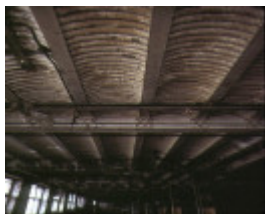
former victoria brewery victoria parade east melbourne interior cellar ceiling sep1985