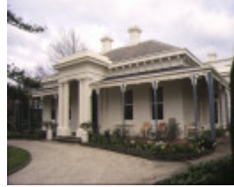
1 claremont noble street newtown front view jul1995