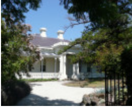
CLAREMONT SOHE 2008