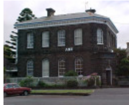
former bank of australasia sackville street port fairy front view nov1999