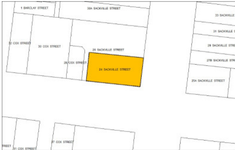
H0749 ho749 former bank of Australasia extent in Mapinfo