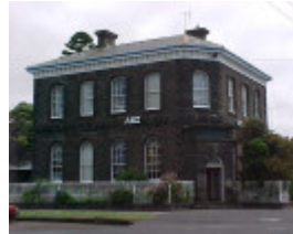
former bank of australasia sackville street port fairy front elevation nov1999