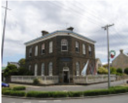
FORMER BANK OF AUSTRALASIA SOHE 2008