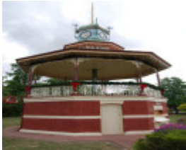
Beaufort Band Rotunda