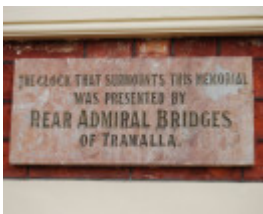
Beaufort Band Rotunda