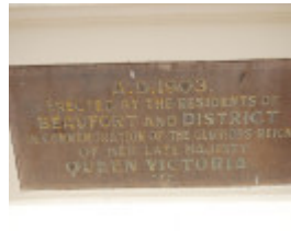
Beaufort Band Rotunda