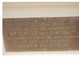
Beaufort Band Rotunda