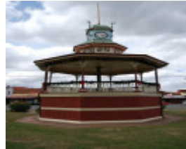
Beaufort Band Rotunda