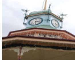
Beaufort Band Rotunda