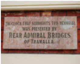
Beaufort Band Rotunda