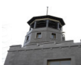
4173 Fire Station