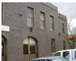
4173 Fire Station