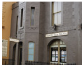
4173 Fire Station