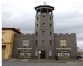
4173 Fire Station