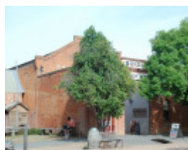
SHACKELLS BOND STORE SOHE 2008