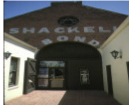
shackells bond store echuca entrance feb1983