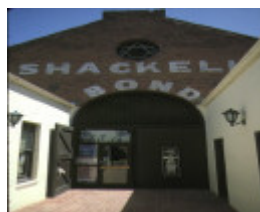
shackells bond store echuca entrance feb1983