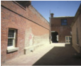
shackells bond store echuca rear view feb1983