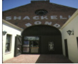
shackells bond store echuca entrance feb1983