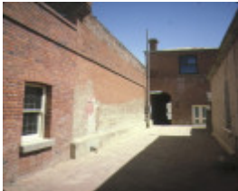
shackells bond store echuca rear view feb1983