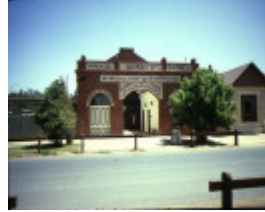
1 shackells bond store echuca front view feb1983