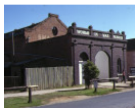
shackells bond store echuca side view may1979