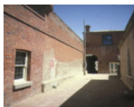
shackells bond store echuca rear view feb1983