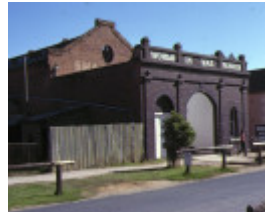
shackells bond store echuca side view may1979