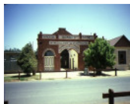
1 shackells bond store echuca front view feb1983