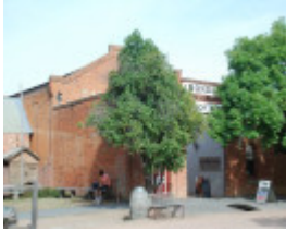
SHACKELLS BOND STORE SOHE 2008