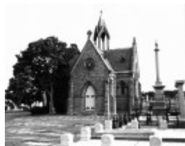
038 - Cemetery Chapel, Carpenter St_Page_1.jpg