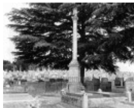
040 - Burke & Wills Monument, Carpenter St.jpg