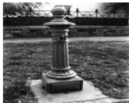
039 - Bendigo Cemetery- Hitching Post, Carpenter St.jpg