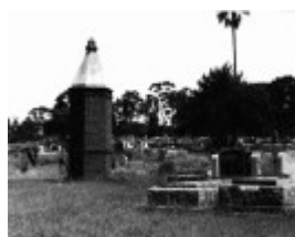
041 - Chinese Burning Towers, Carpenter St.jpg