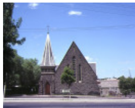
1 church of christ trinity church la trobe terrace geelong front view jan1981