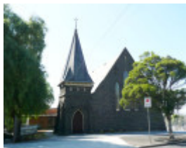
CHURCH OF CHRIST SOHE 2008