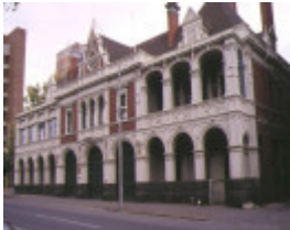
1 eastern hill fire station victoria parade east melbourne front view feb1994