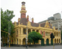
EASTERN HILL FIRE STATION SOHE 2008