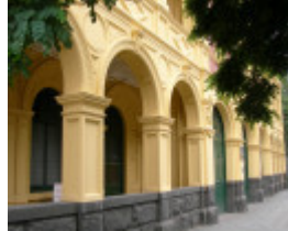
EASTERN HILL FIRE STATION SOHE 2008