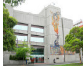
EASTERN HILL FIRE STATION SOHE 2008