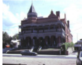
1 queenscliff hotel gellibrand street queenscliff front view mar1985