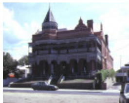
1 queenscliff hotel gellibrand street queenscliff front view mar1985