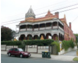
QUEENSCLIFF HOTEL SOHE 2008