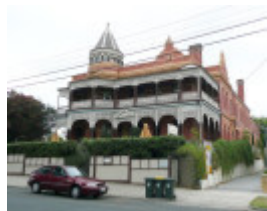
QUEENSCLIFF HOTEL SOHE 2008