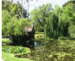
RIPPON LEA SOHE 2008