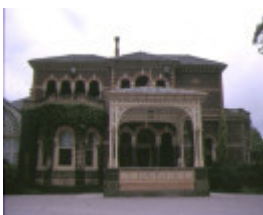
1 ripponlea elsternwick front entrance