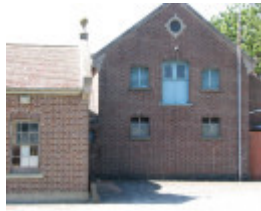
RIPPON LEA SOHE 2008