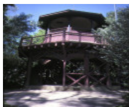
riponlea elsternwick look out tower nov1984