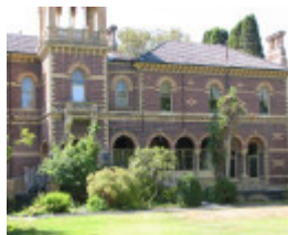
RIPPON LEA SOHE 2008