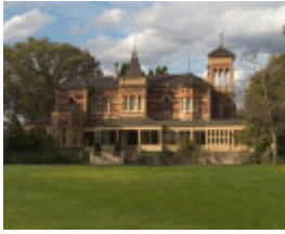
H0614 Rippon Lea - National Trust of Australia (Vic)