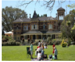
H0614 Rippon Lea family picnic - National Trust of Australia (Victoria)