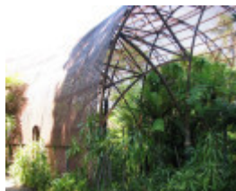
RIPPON LEA SOHE 2008