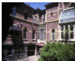
riponlea elsternwick service wing & yard nov1984