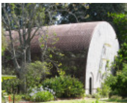
RIPPON LEA SOHE 2008