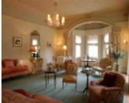
H0614 Rippon Lea sitting - National Trust of Australia (Victoria)