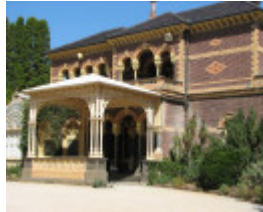
RIPPON LEA SOHE 2008