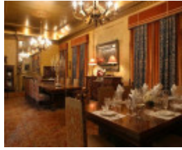
H0614 Rippon Lea Dining - National Trust of Australia (Victoria)