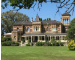
RIPPON LEA SOHE 2008