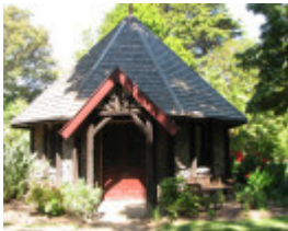
RIPPON LEA SOHE 2008