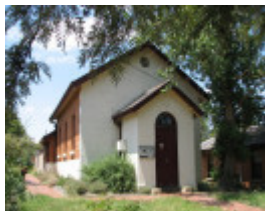
ELTHAM COURT HOUSE SOHE 2008