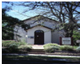
1 eltham court house main road eltham front entrance