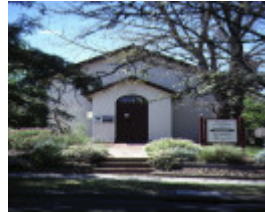
1 eltham court house main road eltham front entrance