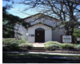
1 eltham court house main road eltham front entrance