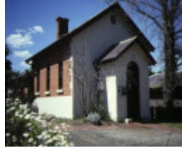
eltham court house main road eltham front corner elevation