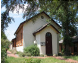
ELTHAM COURT HOUSE SOHE 2008