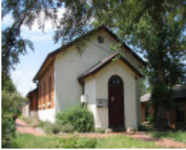
ELTHAM COURT HOUSE SOHE 2008