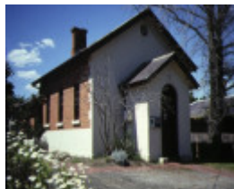
eltham court house main road eltham front corner elevation