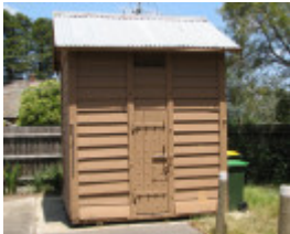
FORMER POLICE QUARTERS SOHE 2008