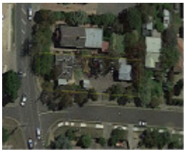
Aerial view of extent of registration