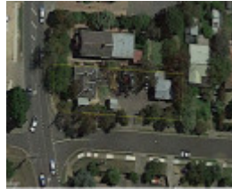
Aerial view of extent of registration