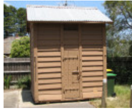
FORMER POLICE QUARTERS SOHE 2008