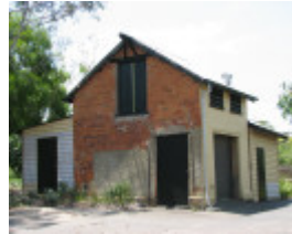
FORMER POLICE QUARTERS SOHE 2008