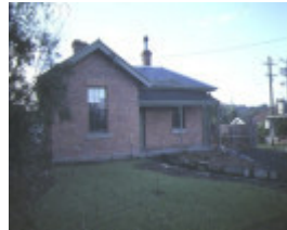
1 former police quarters main road eltham front view apr1986