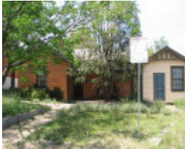
FORMER POLICE QUARTERS SOHE 2008