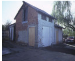
former police quarters main road eltham stables apr1986