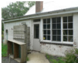
Former Russells Bridge State School, 139 Clyde Hill Road Russells Bridge