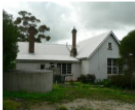
Former Russells Bridge State School, 139 Clyde Hill Road Russells Bridge