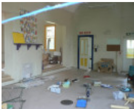
Former Russells Bridge State School, 139 Clyde Hill Road Russells Bridge