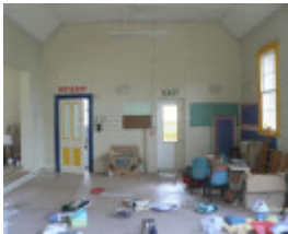
Former Russells Bridge State School, 139 Clyde Hill Road Russells Bridge