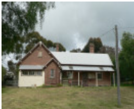
Former Russells Bridge State School, 139 Clyde Hill Road Russells Bridge