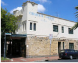
FORMER CHEMIST SHOP SOHE 2008