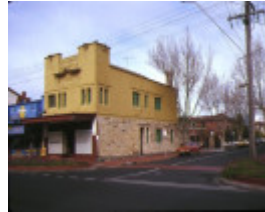
1 former chemist shop ormond road elwood front view