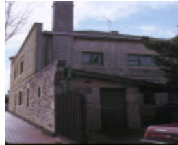
former chemist shop ormond road elwood rear view