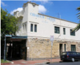
FORMER CHEMIST SHOP SOHE 2008