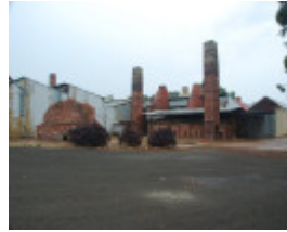
BENDIGO POTTERY SOHE 2008