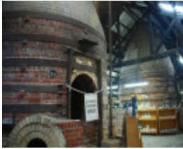
BENDIGO POTTERY SOHE 2008