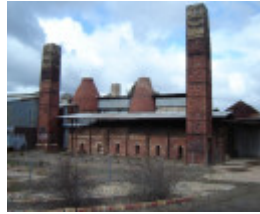
1 Bendigo Pottery North West Facade and Rectangular Kiln 2 (S9), Bottle Kilns 3 & 4 (S3 & S4) and Chimneys 1, 2 & 3 (S10, S11 & S12) 16 August 2005 mz