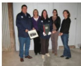
H0674 Bendigo Pottery Heritagecare group