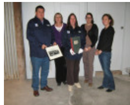
H0674 Bendigo Pottery Heritagecare group