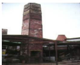
bendigo pottery epsom chimney aug1987