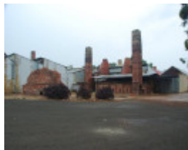
BENDIGO POTTERY SOHE 2008