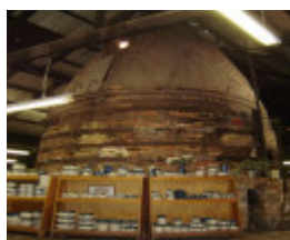
Bendigo Pottery Bottle Kiln (S1) 16 August 2005 mz