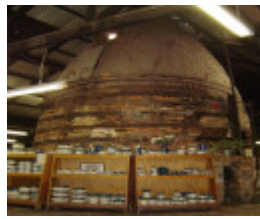
Bendigo Pottery Bottle Kiln (S1) 16 August 2005 mz