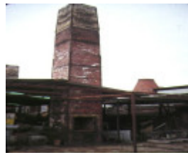
bendigo pottery epsom chimney aug1987