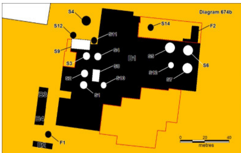
H0674 Bendigo Pottery Plan B Ammended Sept 06