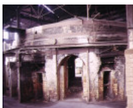
bendigo pottery epsom front view of kiln aug1987