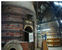
BENDIGO POTTERY SOHE 2008