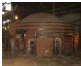
Bendigo Pottery Circular Kiln (S5) 16 August 2005 mz 044