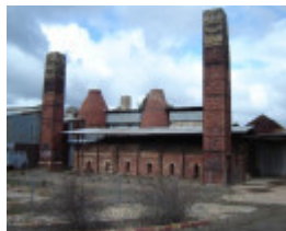
1 Bendigo Pottery North West Facade and Rectangular Kiln 2 (S9), Bottle Kilns 3 & 4 (S3 & S4) and Chimneys 1, 2 & 3 (S10, S11 & S12) 16 August 2005 mz