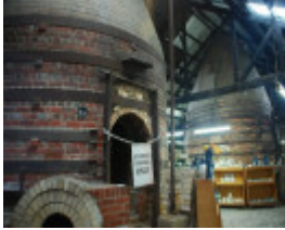
BENDIGO POTTERY SOHE 2008