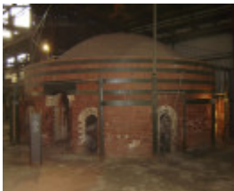
Bendigo Pottery Circular Kiln (S5) 16 August 2005 mz 044