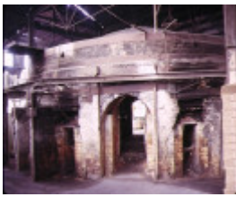
bendigo pottery epsom front view of kiln aug1987