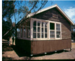
h02051 1 natimuk primary pavilion