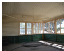
PAVILION CLASSROOM SOHE 2008