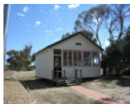
PAVILION CLASSROOM SOHE 2008