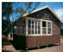
h02051 1 natimuk primary pavilion