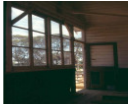
h02051 natimuk primary pavilion interior2