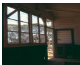
h02051 natimuk primary pavilion interior2