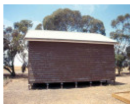
h02051 natimuk primary pavilion