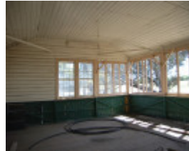
PAVILION CLASSROOM SOHE 2008