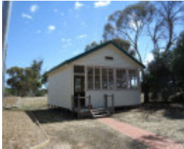
PAVILION CLASSROOM SOHE 2008