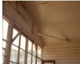
h02051 natimuk primary pavilion interior