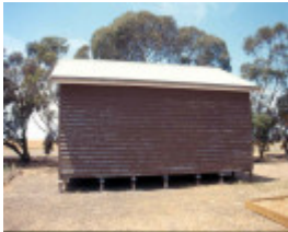
h02051 natimuk primary pavilion