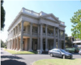
LOWTHER HALL ANGLICAN GIRLS GRAMMAR SCHOOL SOHE 2008