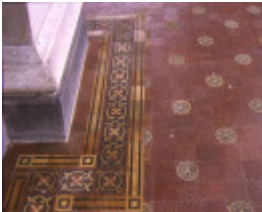
earlsbrae hall essendon detail of tiled entrance