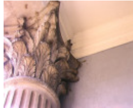
earlsbrae hall essendon detail column capital