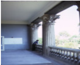
earlsbrae hall essendon view of balcony