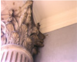
earlsbrae hall essendon detail column capital