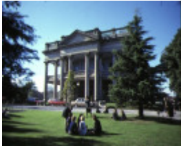
1 earlsbrae hall essendon front view