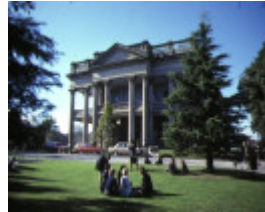
1 earlsbrae hall essendon front view