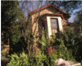
1 charterisville ivanhoe east facade