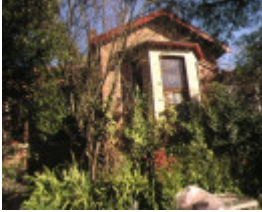
1 charterisville ivanhoe east facade