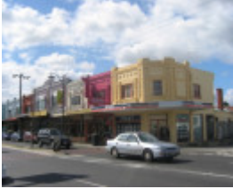
High Street Precinct, Preston