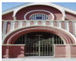
euroa courthouse detail of entrance