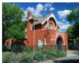
EUROA COURT HOUSE SOHE 2008