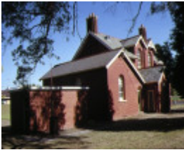
euroa courthouse rear view