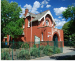
EUROA COURT HOUSE SOHE 2008