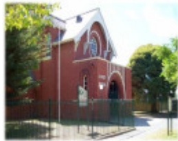
h00960 1 euroa court house binney street euroa street view she project 2004