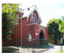
h00960 1 euroa court house binney street euroa street view she project 2004