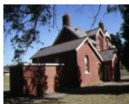
euroa courthouse rear view