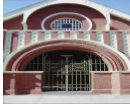
euroa courthouse detail of entrance