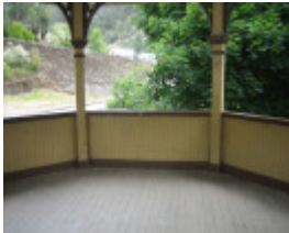
Walhalla bandstand interior looking out