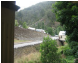
Walhalla Bandstand looking toward former Post Office