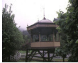
1 walhalla bandstand walhalla front view