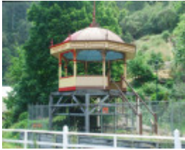
WALHALLA BANDSTAND SOHE 2008