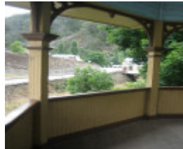
Walhalla Bandstand looking towards stone wall