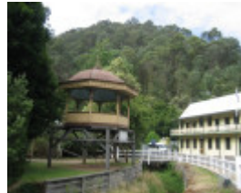
Walhalla Bandstand with Star Hotel