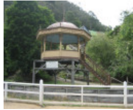
Walhalla Bandstand from the south