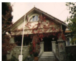
Glendalough Cashmere Street Ascot Vale Front View May 1996