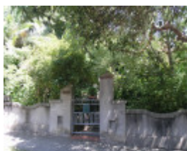
GLENDALOUGH SOHE 2008