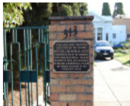
4435 Royal Freemasons Homes 313 Punt Road Gate Plaque 02