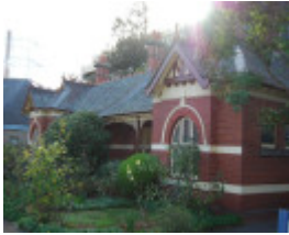
4435_Cottages_Royal_Freema 4435 Royal Freemasons Homes 313 Punt Road Building 02