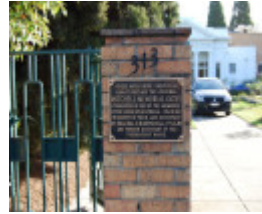
4435 Royal Freemasons Homes 313 Punt Road Gate Plaque 02