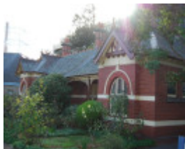
4435_Cottages_Royal_Freema 4435 Royal Freemasons Homes 313 Punt Road Building 02