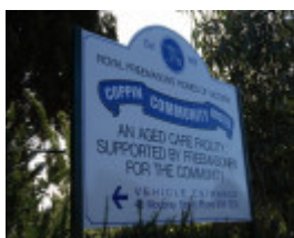
4435 Royal Freemasons Homes 313 Punt Road Sign 02