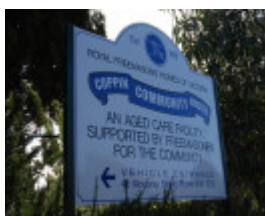
4435 Royal Freemasons Homes 313 Punt Road Sign 02