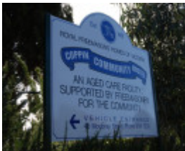
4435 Royal Freemasons Homes 313 Punt Road Sign 02