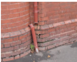
H0048 FORMER RICHMIND SOUTH POST OFFICE LHA 2015 3.JPG