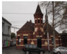
H0048 FORMER RICHMIND SOUTH POST OFFICE LHA 2015 1.JPG