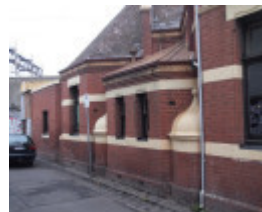
H0048 FORMER RICHMIND SOUTH POST OFFICE LHA 2015 2.JPG