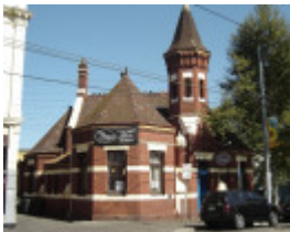
h00048 richmond south post office april05 exterior5