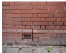
H0048 FORMER RICHMIND SOUTH POST OFFICE LHA 2015 5.JPG