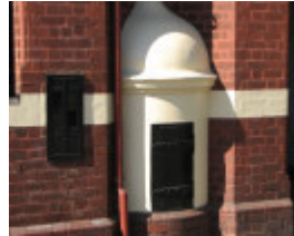
FORMER RICHMOND SOUTH POST OFFICE SOHE 2008