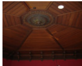
h00048 richmond south post office april05 ceiling public