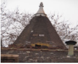
H0048 FORMER RICHMIND SOUTH POST OFFICE LHA 2015 6.JPG