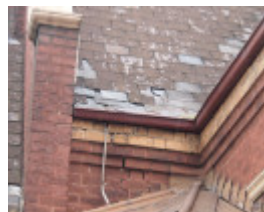
H0048 FORMER RICHMIND SOUTH POST OFFICE LHA 2015 4.JPG