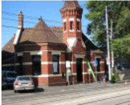
FORMER RICHMOND SOUTH POST OFFICE SOHE 2008