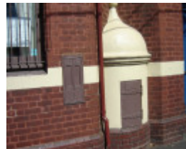
h00048 richmond south post office april05 exterior post boxes