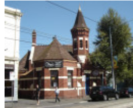
h00048 1 richmond south post office april05 exterior4