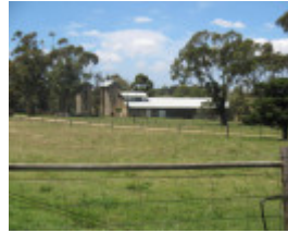
Former Exford Shearing Shed