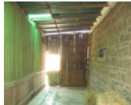
Former Exford Shearing Shed