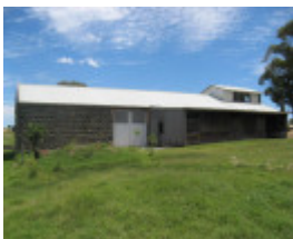
Former Exford Shearing Shed