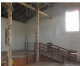
Shearing shed Warrawong_27 Jan 2011 (9).jpg