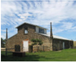
Exford Shearing Shed