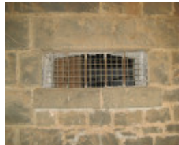
Former Exford Shearing Shed