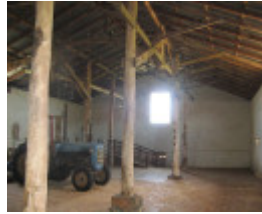
Former Exford Shearing Shed