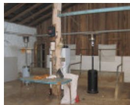
Former Exford Shearing Shed