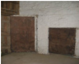
Former Exford Shearing Shed