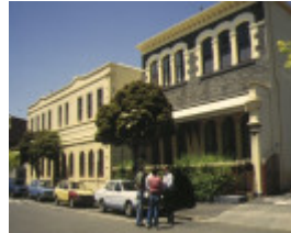
1 former national school bell street fitzroy street view dec1994