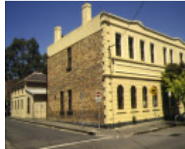
former national school bell street fitzroy front corner view dec1994