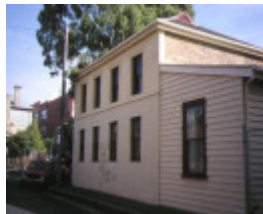
former national school bell street fitzroy building 2 1994