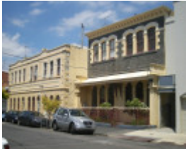
FORMER NATIONAL SCHOOL SOHE 2008