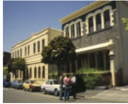
1 former national school bell street fitzroy street view dec1994