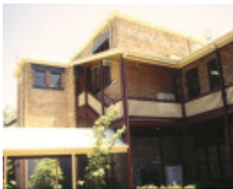
former national school bell street fitzroy rear view of terrace dec1994