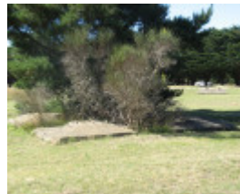
Fiskville concrete pads for mast base