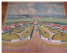
Fiskville painting of complex c1920s