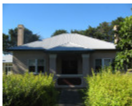
Fiskville one of 8 identical cottages