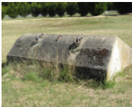
Fiskville concrete block for guy wire anchor