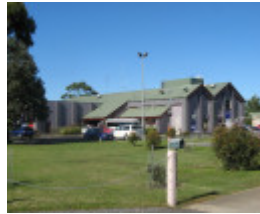
Fiskville power generating building