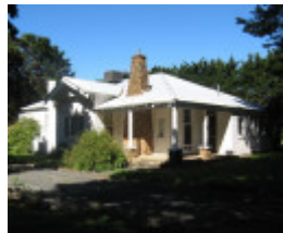
Fiskville manager's residence