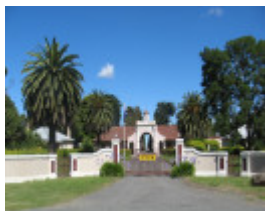
Entrance to accommodation complex