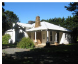
Fiskville manager's residence