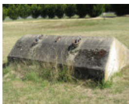
Fiskville concrete block for guy wire anchor