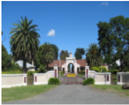
Entrance to accommodation complex