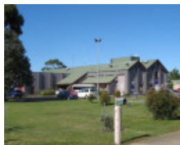
Fiskville power generating building