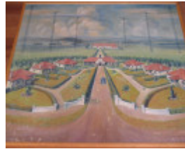
Fiskville painting of complex c1920s