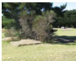
Fiskville concrete pads for mast base