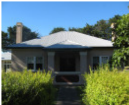
Fiskville one of 8 identical cottages