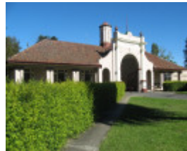
Fiskville recreation building