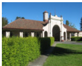
Fiskville recreation building