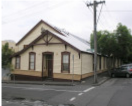
RICHMOND RIFLES VOLUNTEER ORDERLY ROOM SOHE 2008