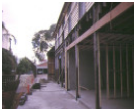
1 former richmond drill hall gipps street richmond rear view