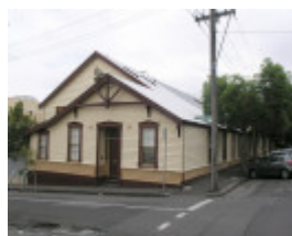
RICHMOND RIFLES VOLUNTEER ORDERLY ROOM SOHE 2008