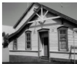
1 former richmond drill hall gipps street richmond front view