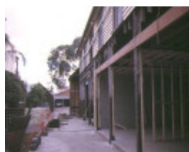
1 former richmond drill hall gipps street richmond rear view