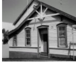
1 former richmond drill hall gipps street richmond front view