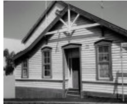
1 former richmond drill hall gipps street richmond front view