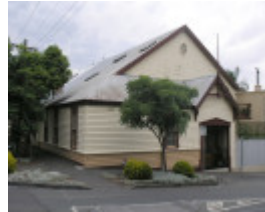
RICHMOND RIFLES VOLUNTEER ORDERLY ROOM SOHE 2008