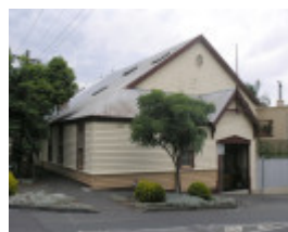
RICHMOND RIFLES VOLUNTEER ORDERLY ROOM SOHE 2008