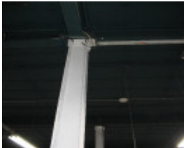
Dimmeys_Richmondinterior columns_9 July 08