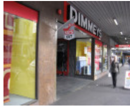
Dimmeys_Richmond_shop windows_9 July 08