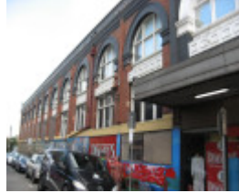
Dimmeys_Richmond_Green St elevation_9 July 08