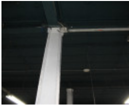
Dimmeys_Richmondinterior columns_9 July 08