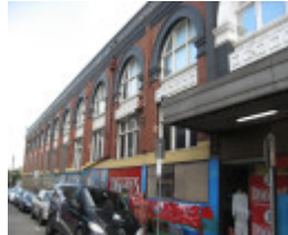
Dimmeys_Richmond_Green St elevation_9 July 08