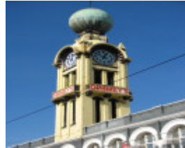
Dimmeys_Richmond_tower_K. July 08