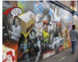
Dimmeys_Richmond_part of Green St mural_9 July 08