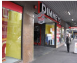
Dimmeys_Richmond_shop windows_9 July 08