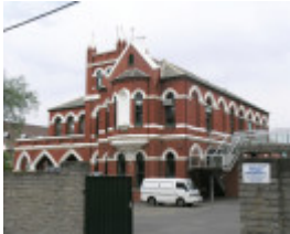
VAUCLUSE COLLEGE SOHE 2008