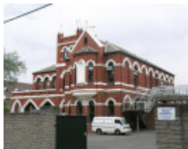
VAUCLUSE COLLEGE SOHE 2008