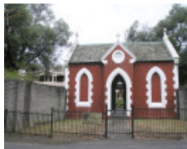
VAUCLUSE COLLEGE SOHE 2008