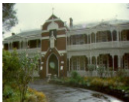
1 vaucluse college richmond convent 1999