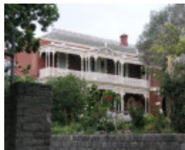
VAUCLUSE COLLEGE SOHE 2008