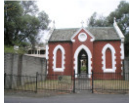
VAUCLUSE COLLEGE SOHE 2008