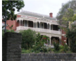
VAUCLUSE COLLEGE SOHE 2008