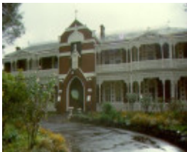
1 vaucluse college richmond convent 1999