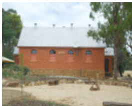
GUILDFORD PRIMARY SCHOOL NO. 264 SOHE 2008