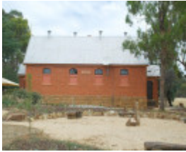
GUILDFORD PRIMARY SCHOOL NO. 264 SOHE 2008