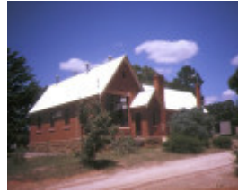
1 guildford primary school number 264 franklin street guildford corner view jan1989