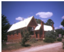
1 guildford primary school number 264 franklin street guildford corner view jan1989