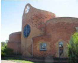
Church of St Michael & St John