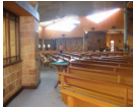
Church of St Michael & St John