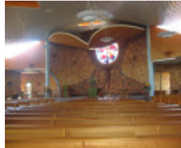
Church of St Michael & St John