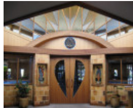
Church of St Michael & St John