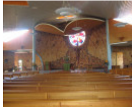
Church of St Michael & St John