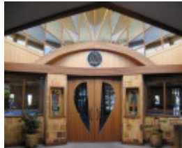
Church of St Michael & St John