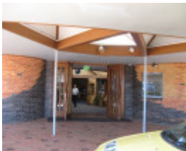
Church of St Michael & St John