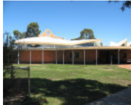
Church of St Michael & St John