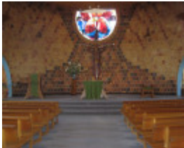
Church of St Michael & St John