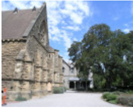
CHRIST CHURCH COMPLEX SOHE 2008