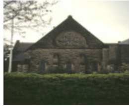
1 christ church complex church square st kilda west front of church