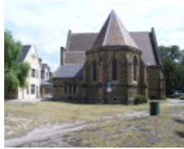
CHRIST CHURCH COMPLEX SOHE 2008