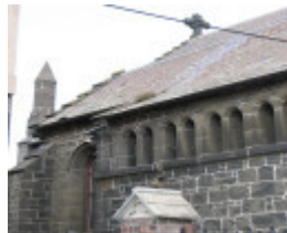
ST MARKS ANGLICAN CHURCH SOHE 2008