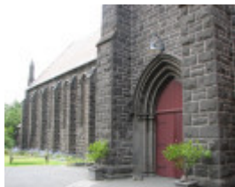
ST MARKS ANGLICAN CHURCH SOHE 2008