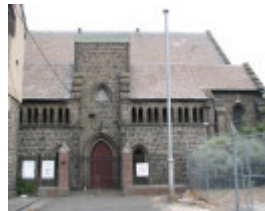
ST MARKS ANGLICAN CHURCH SOHE 2008