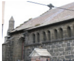
ST MARKS ANGLICAN CHURCH SOHE 2008