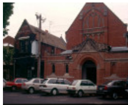
St Marks George St Fitzroy Parish Hall