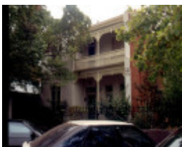
St Marks George St Fitzroy Vicarage