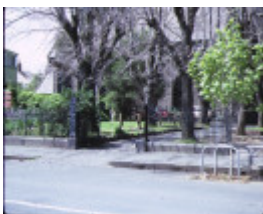
1 st marks anglican church george street fitzroy front view oct1986