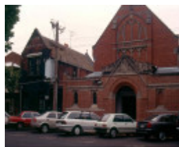
St Marks George St Fitzroy Parish Hall