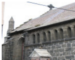
ST MARKS ANGLICAN CHURCH SOHE 2008