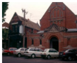
St Marks George St Fitzroy Parish Hall