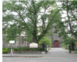
ST MARKS ANGLICAN CHURCH SOHE 2008