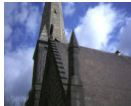
st marks anglican church george street fitzroy spire view