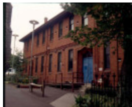
St Marks Anglican Church George Street Fitzroy Community Centre