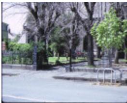
1 st marks anglican church george street fitzroy front view oct1986