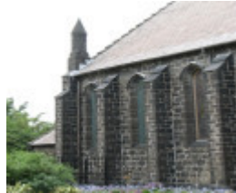
ST MARKS ANGLICAN CHURCH SOHE 2008