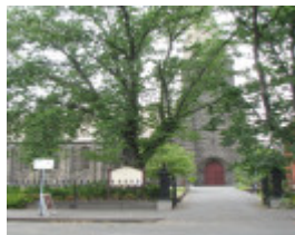
ST MARKS ANGLICAN CHURCH SOHE 2008