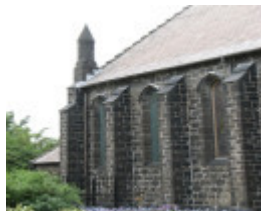
ST MARKS ANGLICAN CHURCH SOHE 2008