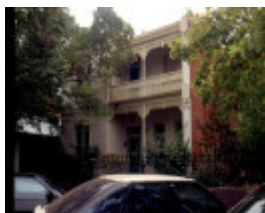
St Marks George St Fitzroy Vicarage