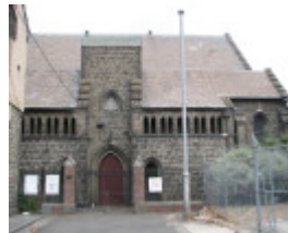
ST MARKS ANGLICAN CHURCH SOHE 2008