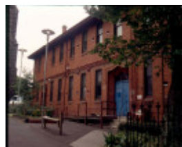
St Marks Anglican Church George Street Fitzroy Community Centre