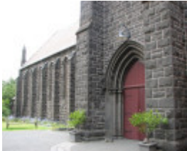
ST MARKS ANGLICAN CHURCH SOHE 2008