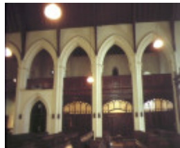
st marks anglican church george street fitzroy interior nave arches jul1980