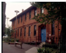
St Marks Anglican Church George Street Fitzroy Community Centre