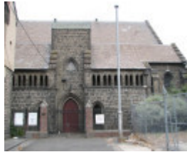
ST MARKS ANGLICAN CHURCH SOHE 2008