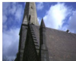
st marks anglican church george street fitzroy spire view