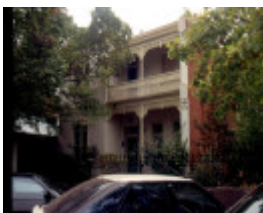
St Marks George St Fitzroy Vicarage