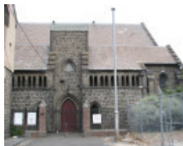
ST MARKS ANGLICAN CHURCH SOHE 2008