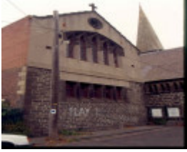
St Marks George St Fitzroy Former Sunday School