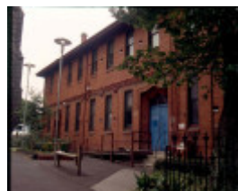
St Marks Anglican Church George Street Fitzroy Community Centre