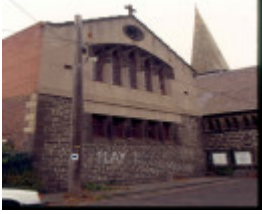
St Marks George St Fitzroy Former Sunday School