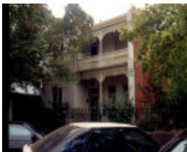
St Marks George St Fitzroy Vicarage