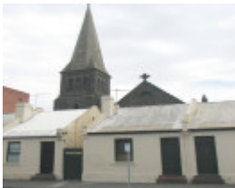
ST MARKS ANGLICAN CHURCH SOHE 2008