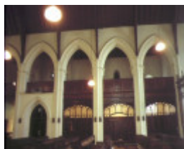
st marks anglican church george street fitzroy interior nave arches jul1980