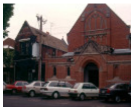
St Marks George St Fitzroy Parish Hall