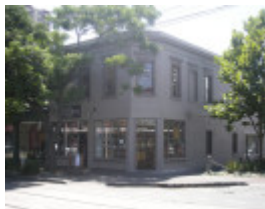
SHOPS SOHE 2008