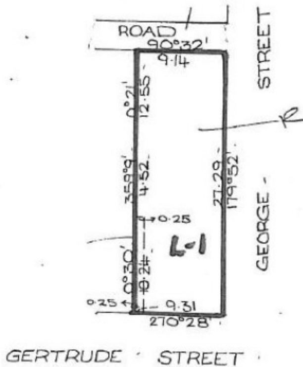
H0886 H0886 plan 2