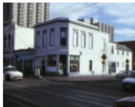
1 181 183 gertrude street fitzroy front corner view aug1990