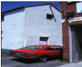
181 183 gertrude street fitzroy rear view aug1990