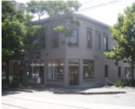
SHOPS SOHE 2008