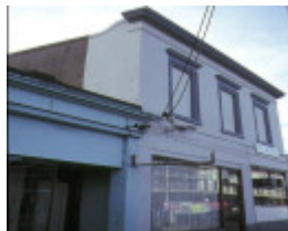
181 183 gertrude street fitzroy front elevation dec1990