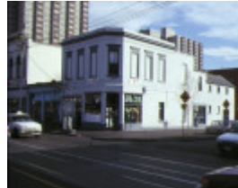
1 181 183 gertrude street fitzroy front corner view aug1990