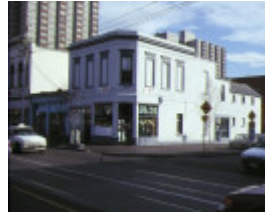
1 181 183 gertrude street fitzroy front corner view aug1990