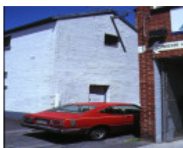
181 183 gertrude street fitzroy rear view aug1990