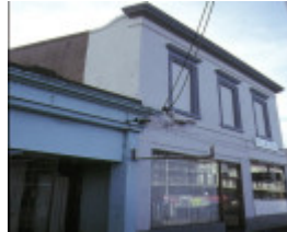
181 183 gertrude street fitzroy front elevation dec1990