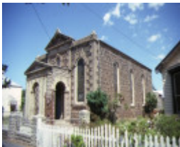
former wesleyan church parsonage & common school james street port fairy front corner view of church feb1990