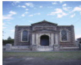
Former Wesleyan Church Parsonage & Common School James Street Port Fairy Front View of Church February 1990