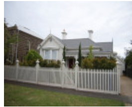
FORMER WESLEYAN CHURCH, PARSONAGE AND COMMON SCHOOL SOHE 2008