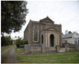
FORMER WESLEYAN CHURCH, PARSONAGE AND COMMON SCHOOL SOHE 2008