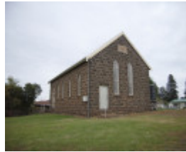
FORMER WESLEYAN CHURCH, PARSONAGE AND COMMON SCHOOL SOHE 2008